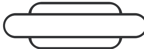
BR TOTEM STYLE