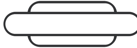
BR TOTEM STYLE